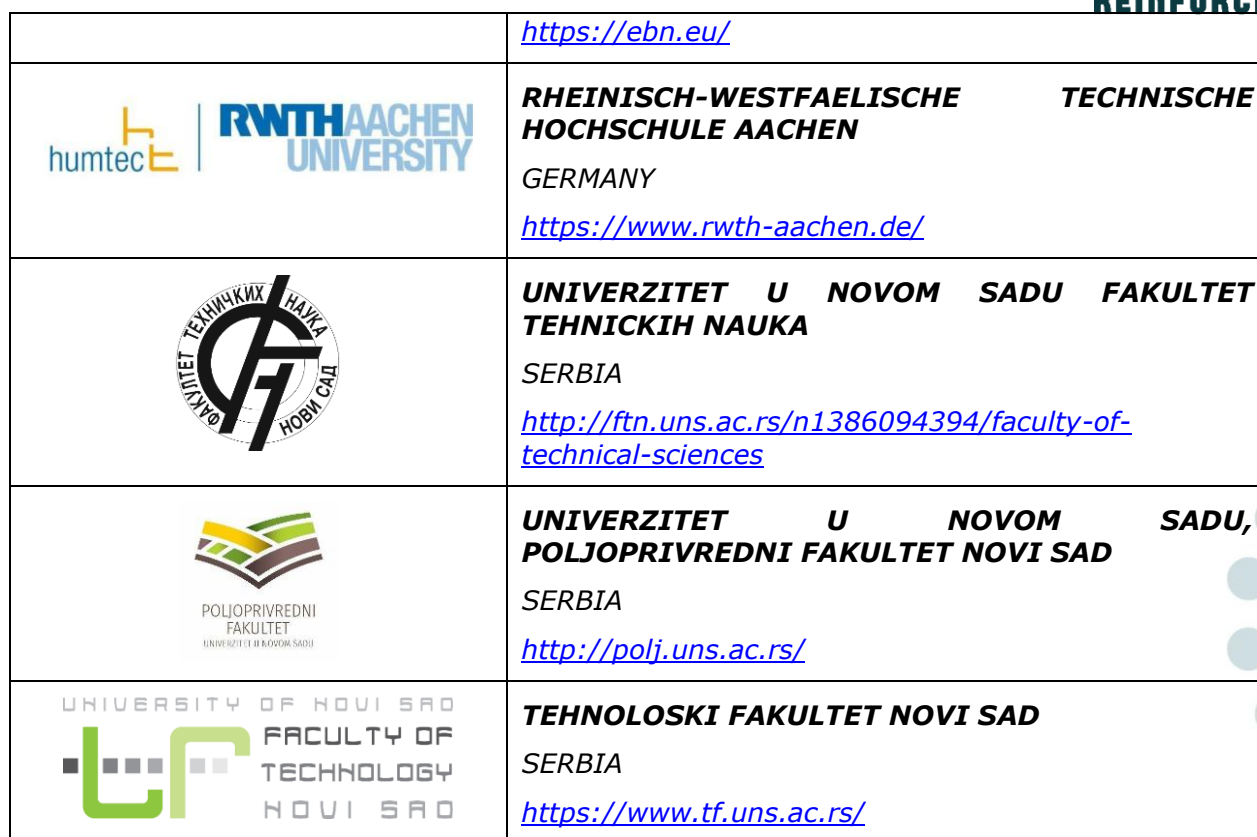
Table 2: REINFORCING partners